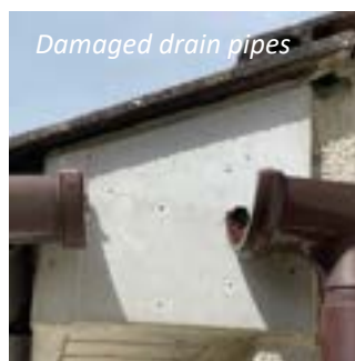
Damaged drain pipes

Graffiti has been appearing on various bollards and lamp posts around the parish. Actions like this harm the community and take valuable resources away from other important projects.