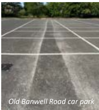
Old Banwell Road car park

Thanks to the excellent work of N Bartlett Ltd for resurfacing and WSM Traffic Management for line marking. The parking spaces are now clearly marked, making the area more organised and user-friendly. We believe this new layout will help to reduce congestion, improve safety, and provide a more accessible space for everyone who uses the car park.