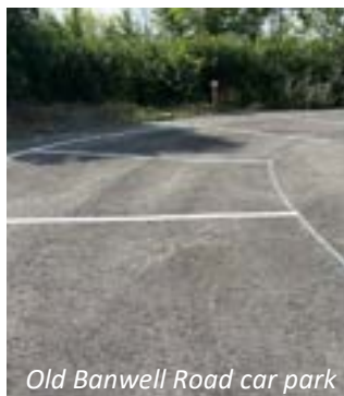
Old Banwell Road car park

Thanks to the excellent work of N Bartlett Ltd for resurfacing and WSM Traffic Management for line marking. The parking spaces are now clearly marked, making the area more organised and user-friendly. We believe this new layout will help to reduce congestion, improve safety, and provide a more accessible space for everyone who uses the car park.