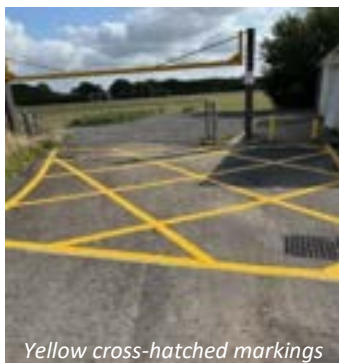
Yellow cross-hatched markings

We are delighted to share an update on the recent improvements made to the Old Banwell Road car park. As part of our ongoing efforts to enhance the facilities for the community, we are pleased to announce that the much-needed car park lining project has now been completed.