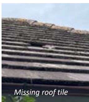
Missing roof tile

We are currently working to assess the full extent of the damage and arrange the necessary repairs. We would ask everyone to remain vigilant and help us protect our shared spaces by reporting any further incidents to the Police.