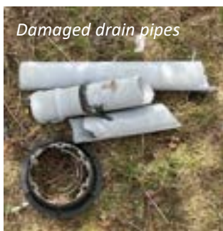
Damaged drain pipes