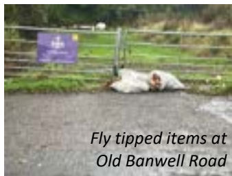
Fly tipped items at Old Banwell Road

Fly Tipping incidents continue to be a problem in our community. Fly tipped waste includes household waste, building rubble, domestic white goods, and clothes – Below is a photograph of waste dumped at Old Banwell Road last week: