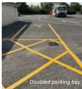
Disabled parking bay

Looking ahead, the next step in improving the car park will be the installation of electric gates. These gates will ensure that the car park remains secure while also allowing access throughout the day, making it even easier for residents and visitors to use the space as needed. We will keep you updated as the next phase of the project progresses.